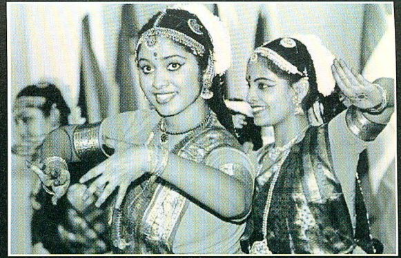
Members of the Kalapadama Dance Academy perform traditional Hindu dances at the International Festival of Arts held in October at Truman College. The festival also included performances by the Tamburitza Dance Group, performing Croatian dances, and the University Bible Fellowship Orchestra, as well as performances by Truman College students.